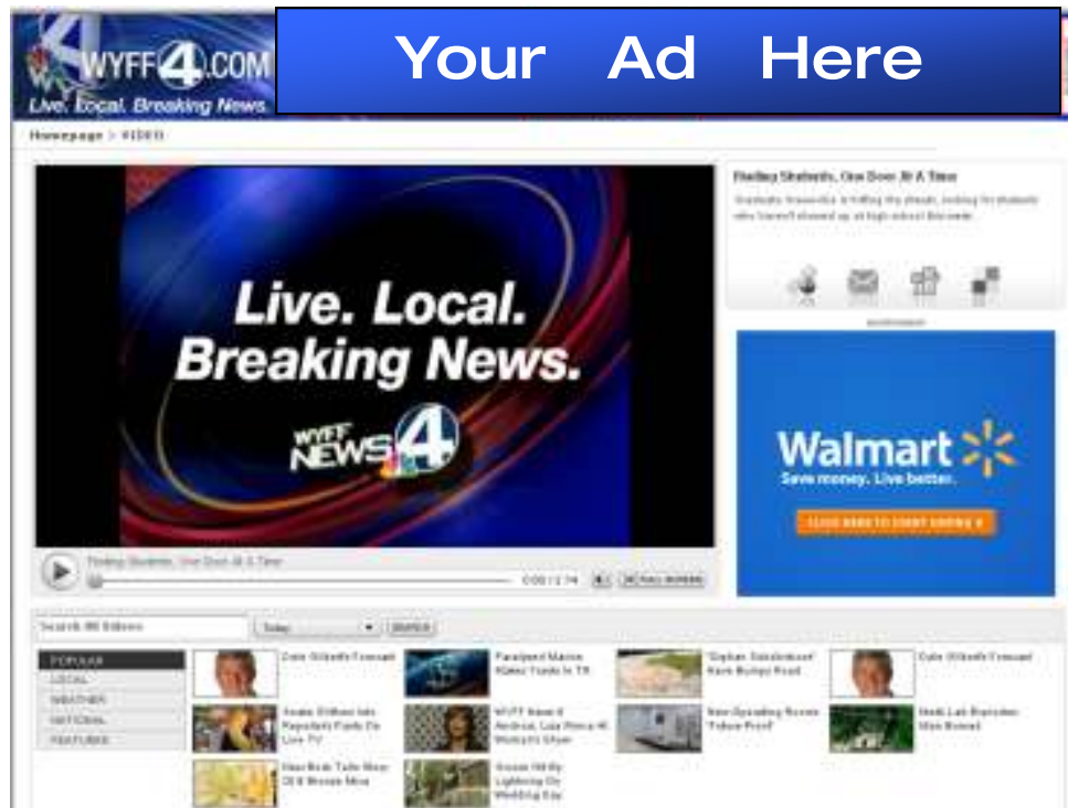
Video Section & Viewer Playlist