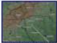
Live Super Doppler 4 HD