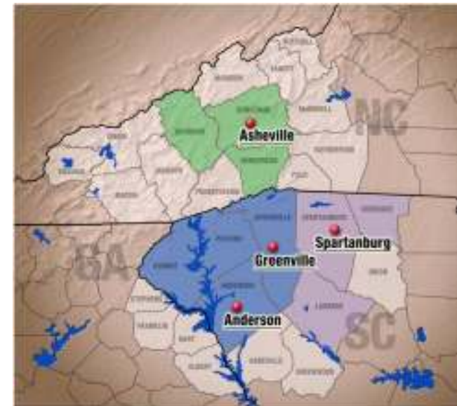
Surveyed area in DMA